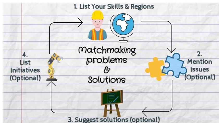
Figure 3: Our Solution (Summary)

In essence we will be linking volunteers, and lightly paid individuals, to troubled sites across the world where they can make the most impact. The web platform will also provide a constantly up-to-date database of issues, solutions and initiatives across the world. It will not only provide people who are genuinely willing to make the world a better place with the information they need, but also how to go about it.